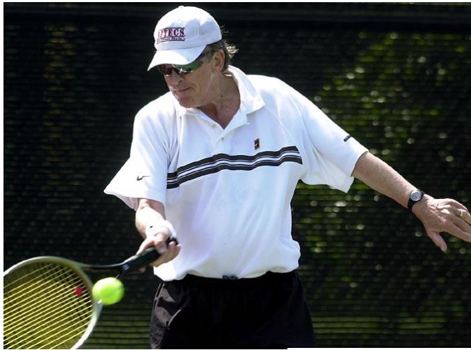
Calderon/The Desert Sun