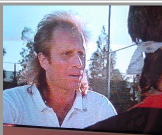
Vitas Gerulaitis in 1990 cameo role as a coach.