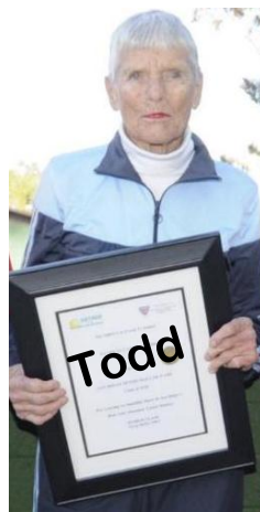
Patricia Canning Todd, international champion and top 10, teaching professional

%she won a total of four Grand Slam championships, singles at the French Championships in 1947, women's doubles at the French and Wimbledon in 1948 and the mixed in the 1948 French. Todd also reached the French final in 1950. She won the singles and mixed at the South American championships in 1947 and 1948. Pat captured the singles and doubles titles at the Asian Championships and the Championships of India. She was ranked in the world top ten from 1946 through 1952, with a career high of four, and ranked in the US top ten in 1942 and 1944 through 1952.+