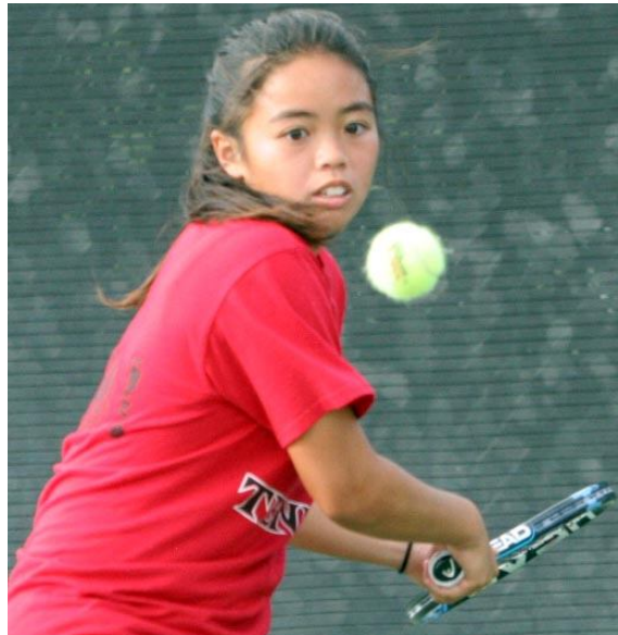
Aztec Tennis Reporter