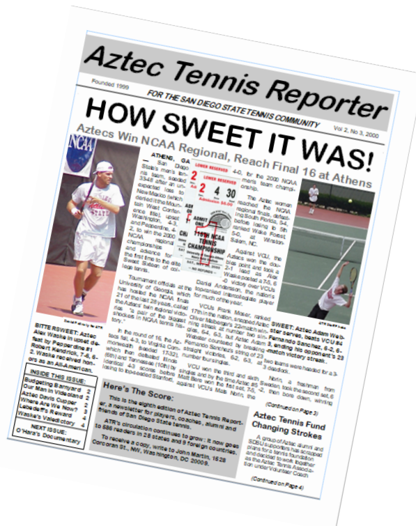
Aztec Tennis Reporter, front page, Vol 2, No. 3, 2000

In the Round of 16, the Aztecs fell 4-3 to VCU, which then defeated Illinois (ranked 6th) and Tennessee (ranked 10th) by identical 4-3 scores before losing to top-seeded Stanford, 4-2.