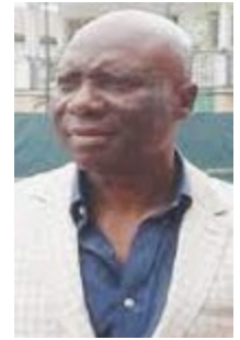
Screen Capture Kienka