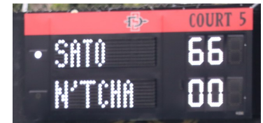
Scorekeeper, left, and Scoreboard

board flashed the remarkable image as other matches continued.