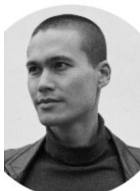
Screen Capture Tim Schulz Van Endert

It seems that the best we can do and teach our children is to cultivate self-control, i.e. the ability to align one's thoughts, emotions and behavior with set goals. Fortunately, that is something athletes learn naturally if they want to excel in their